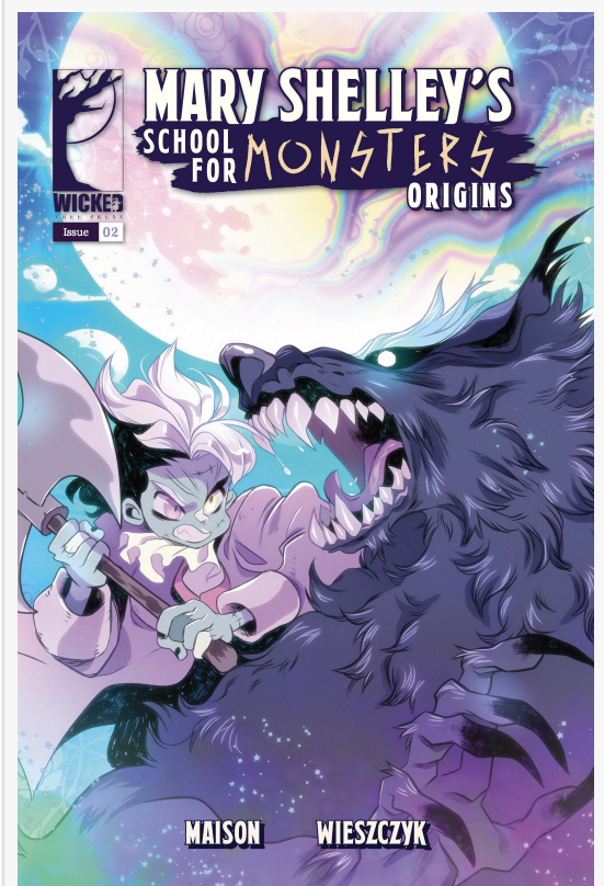
Mary Shelley's School for Monsters: Origins #2 Cover