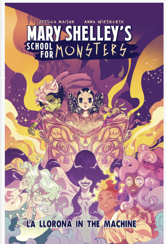
Foreword INDIES finalist Mary Shelley's School for Monsters: La Llorona in the Machine

Speaking of excitement, last year's major crowdfunding success from Wicked Tree Press, Mary Shelley's School for Monsters: La Llorona in the Machine , is a finalist in the Foreword INDIES Book of the Year Awards. Foreword Reviews is a platform dedicated to discovering, reviewing, and sharing works from university and independent publishers. Mary Shelley's School for Monsters was selected by Foreword's editorial team as a finalist in the graphic novel category.