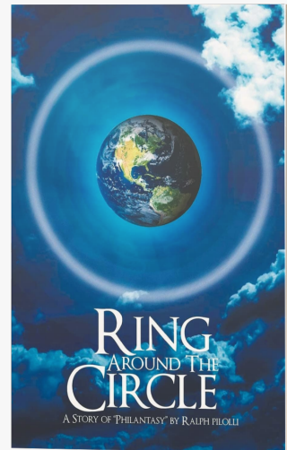
Ring Around the Circle

With "Ring Around the Circle" and "Philantasy, The Reality of Imagination" lining the shelves of the London Book Fair 2024, Pilolli's observations serve as a tribute to the timeless appeal of narrative and the limitless capacity of the human spirit to delve into the limits of creativity.