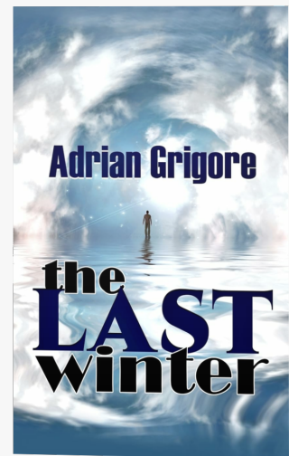
The Last Winter

Grigore's poetic work portrays chaotic post-revolutionary Romania, capturing the spirit of a country in transition with unmatched depth and clarity. Set against a backdrop of unpredictability and instability, "The Last Winter" is a powerful meditation on the resilience of the human spirit and the continuous search for truth and purpose in a troubled world. Grigore's masterful storytelling transports his audience on a journey of self-discovery and redemption,