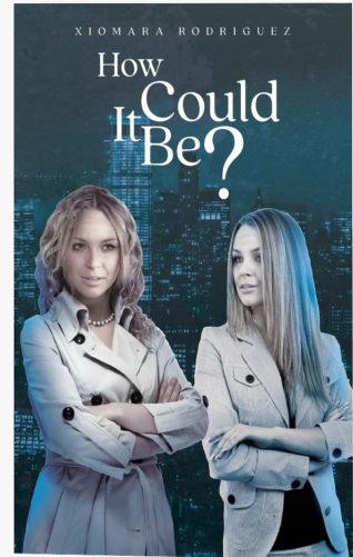
How Could It Be?

Pilolli crafts a story that transcends time in "Ring Around the Circle: A Story of 'Philantasy,'" bringing readers into a beautiful tapestry that combines aspects of fiction and reality. Readers are taken to both ancient and modern eras as the story