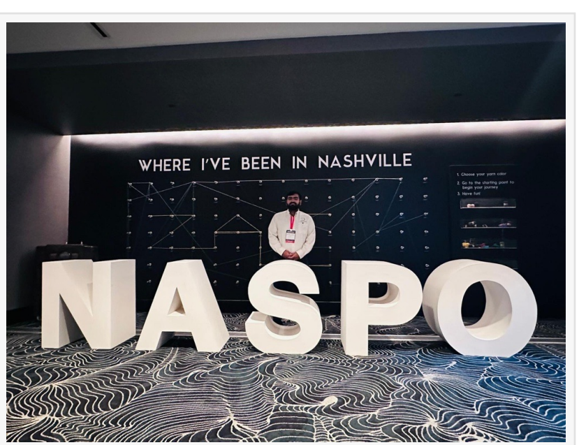
DatamanUSA, a temporary staffing company with expertise in all job categories, attended the Annual NASPO Exchange as a Temporary Staffing Contract Holder.

Dataman got a chance to showcase its capabilities at the recent Annual NASPO Exchange that was held from