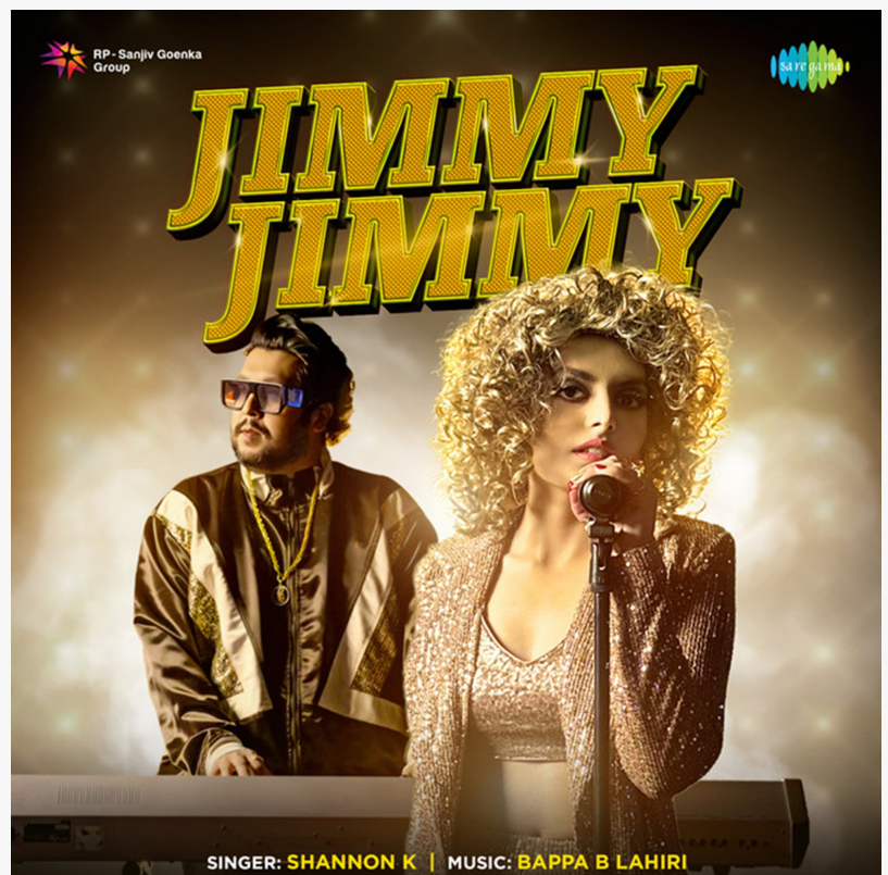
New cover song is an homage to Bollywood’s King of Disco, Bappi Lahiri, a revamped version of the nostalgic hit, “Jimmy Jimmy Jimmy Aaja”.