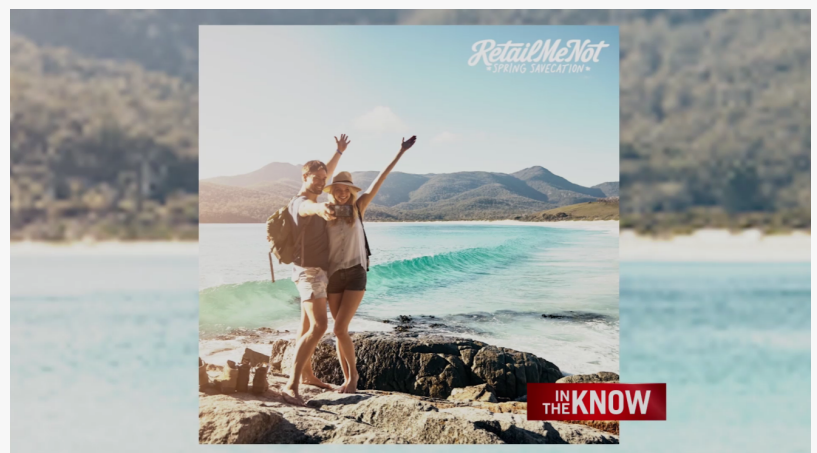
Retail Me Not