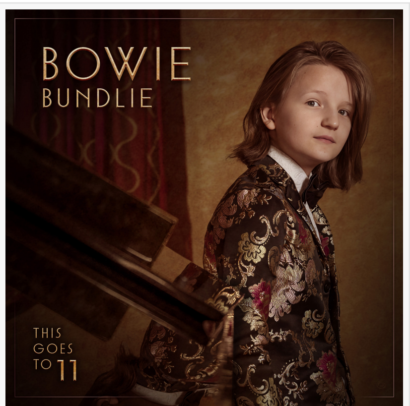
Bowie Bundlie Album Cover