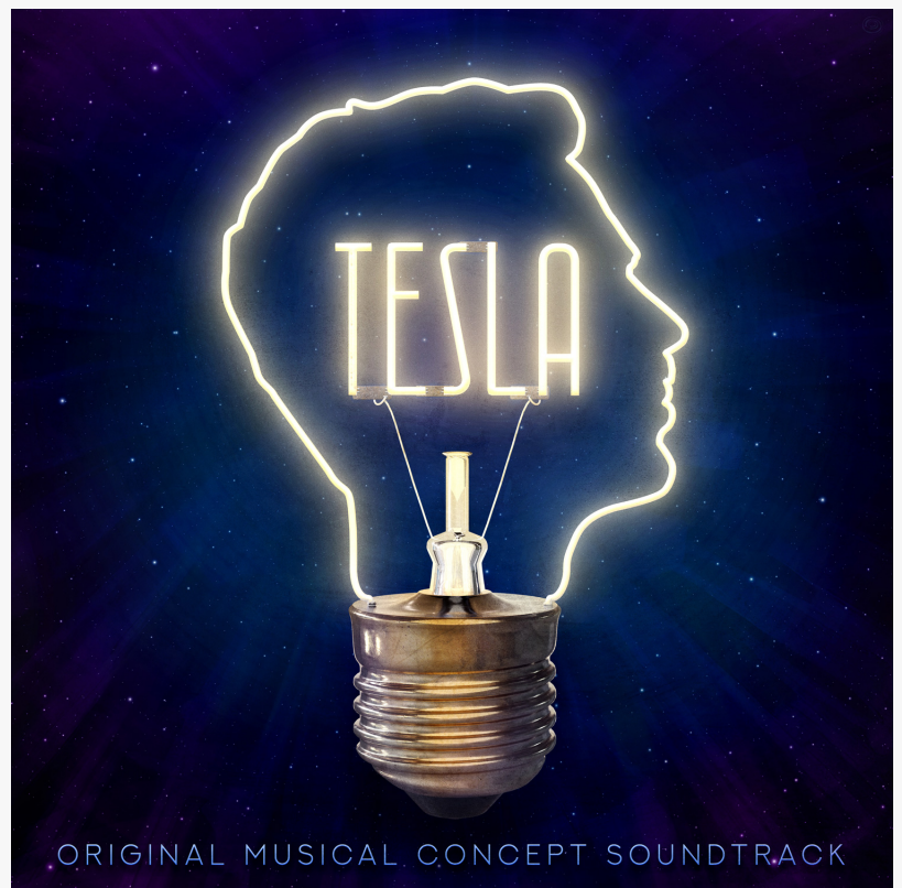
The Tesla Musical