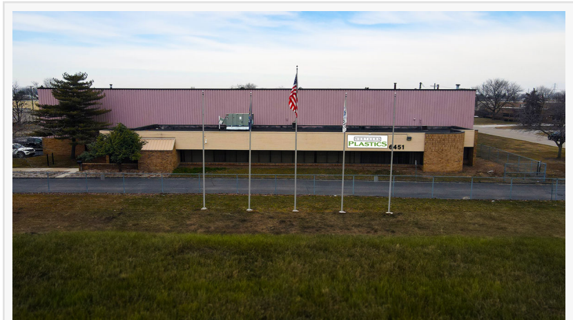
Northern Plastics in Sterling Heights

In a strategic move to broaden its market offerings and capabilities, National Composites, a leader in OEM supply of custom molded products and full metal cab fabrications and assembly, is thrilled to announce the acquisition of Northern Plastics, a Sterling Heights based specialist in Thermo/Vacuumform plastic manufacturing.