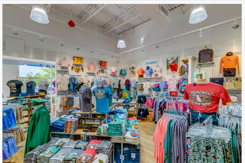
Palmetto Moon Store Interior Displays

"We're thrilled about Palmetto Moon's expansion, from our humble beginnings as a kiosk in Charleston, South Carolina, to now 44 stores across