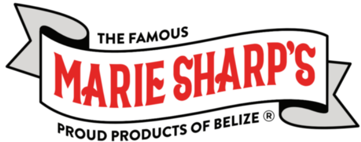
Marie Sharp's Fine Foods Ltd. Logo