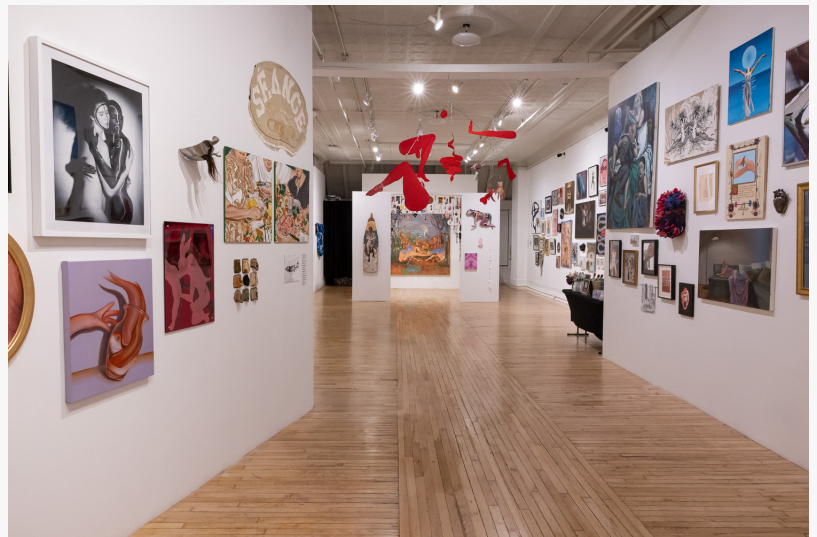
Installation image of Every Woman Biennial, 2024