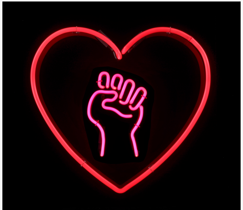
Michele Pred, Art As Activism, 2022, neon, courtesy artist and Nancy Hoffman Gallery

NEW YORK, NY, USA, March 11, 2024 /EINPresswire.com/ -- The Every Woman Biennial , the female and non-binary art festival (originally launched as The Whitney Houston Biennial in 2014), presents its 5th edition, March 2-March 24, 2024, timing with Women's History Month and The Whitney Biennial, at La MaMa Galleria in downtown NYC. The theme and title is "I WILL ALWAYS LOVE YOU," and the Biennial features 200 artists selected from an open call to participate in a dynamic salon and performances.