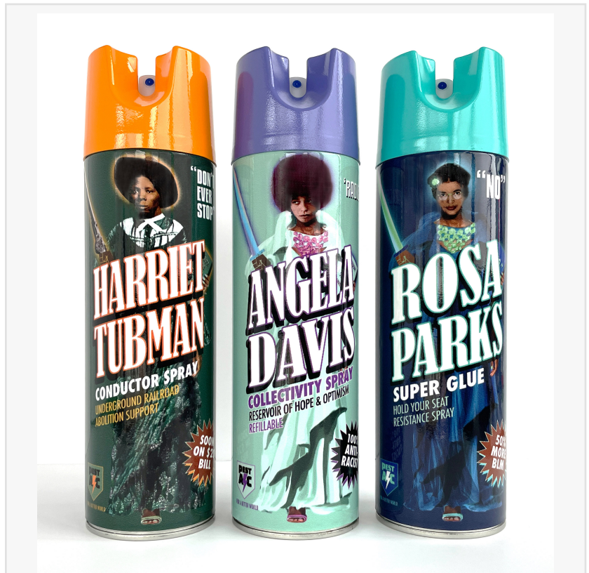
Airco Caravan, Power Trio, Spray Cans and labels