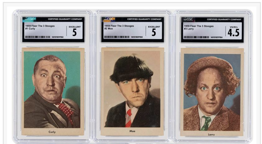
Complete 1959 Fleer 'The Three Stooges' master set of 99 collector cards, each one CGC graded, and the set graded 5.53 overall. Estimate: $10,000-$20,000

To get the good stuff, Star Wars fans know they can count on Hake's. The upcoming sale includes