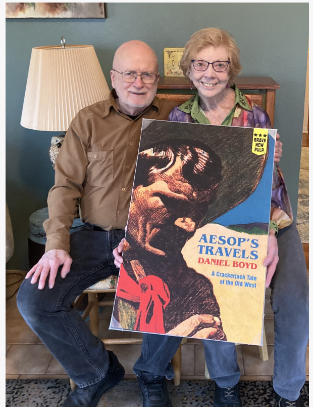
Author & his wife display AESOP'S TRAVELS poster