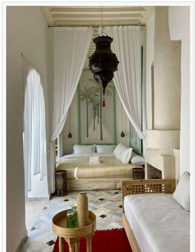
Bedroom 7 Riad Tizwa Marrakech Morocco.