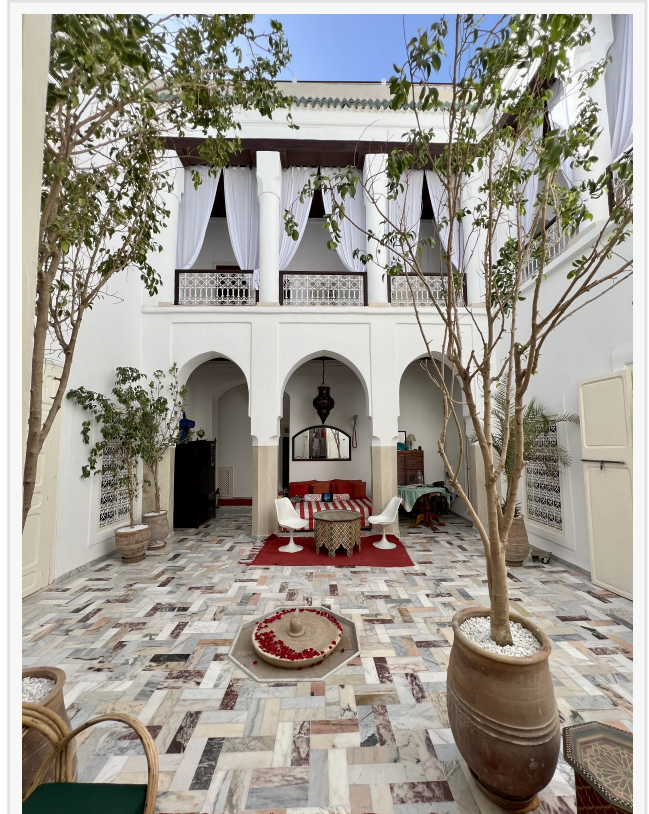
Riad Tizwa Marrakech - Dar El Bacha

In 2008, the hotel received the esteemed Clef Verte International eco-label and was amongst the first Riads in Morocco to achieve the sustainable business practice award.