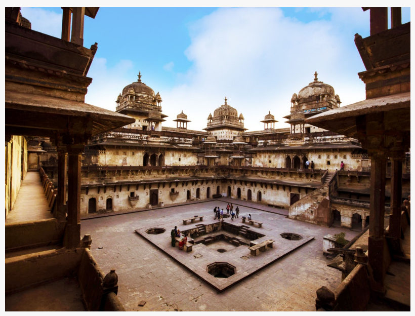
Jahangir Mahal - Orchha