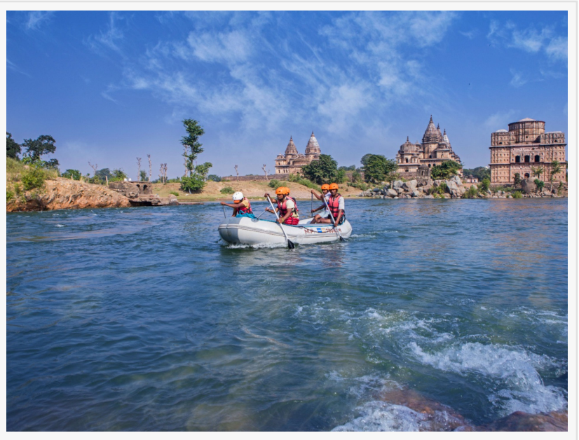
River Rafting - Orchha

Madhya Pradesh is steadfast in its commitment to fostering sustainable tourism practices, ensuring the preservation of its natural beauty and cultural heritage for generations to come. Join us as we delve into initiatives promoting responsible tourism, conservation endeavors, and community-based tourism projects aimed at empowering local communities.