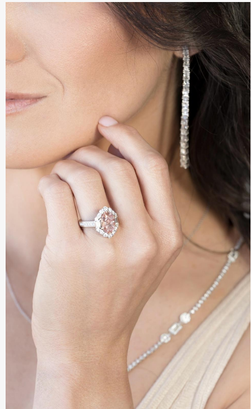
London Gold's Yael Designs Collection Earrings and Pink Ring