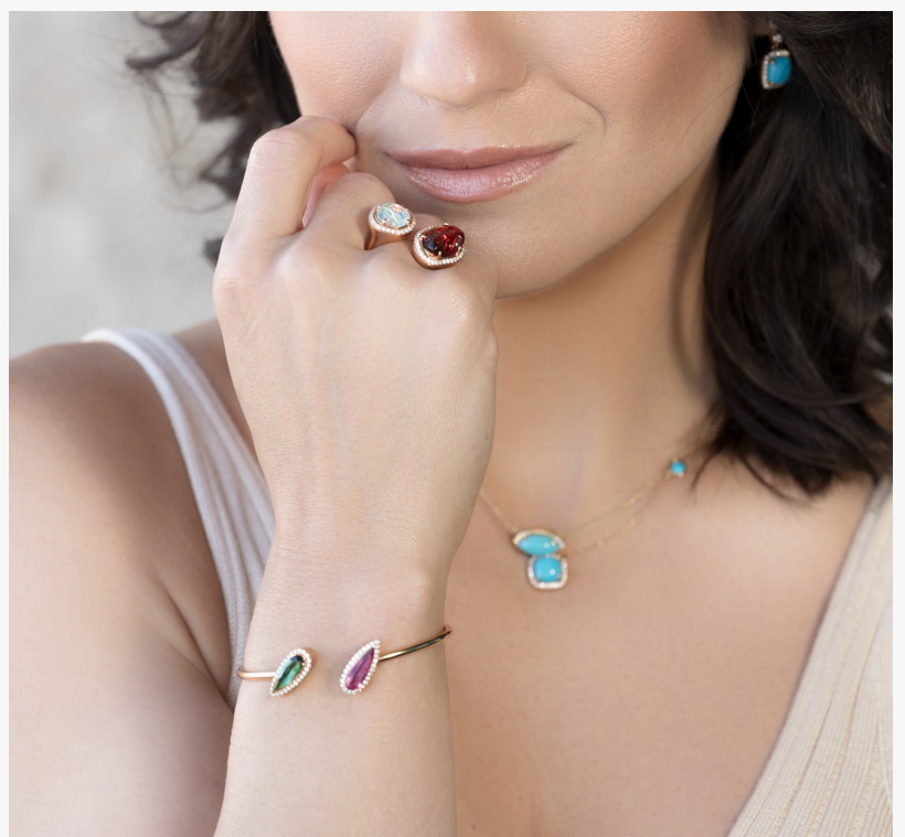
London Gold's Yael Designs Collection

SCOTTSDALE, AZ, UNITED STATES, March 14, 2024 /EINPresswire.com/ -- In February, London Gold organized a photo shoot showcasing a new selection of jewelry that underscores the brand's commitment to elegance and craftsmanship. The shoot featured an array of layered necklaces and stackable rings, along with the debut of new custom pieces by Yael Designs , emphasizing the beauty of gemstones and diamonds, notably emeralds and sapphires.