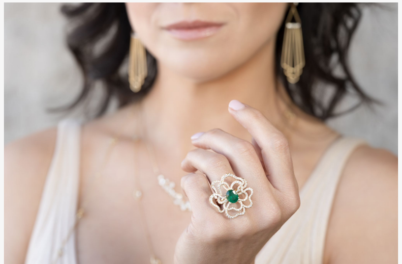
London Gold Yael Designs Floral Emerald Cocktail Ring

This press release can be viewed online at: https://www.einpresswire.com/article/695332178