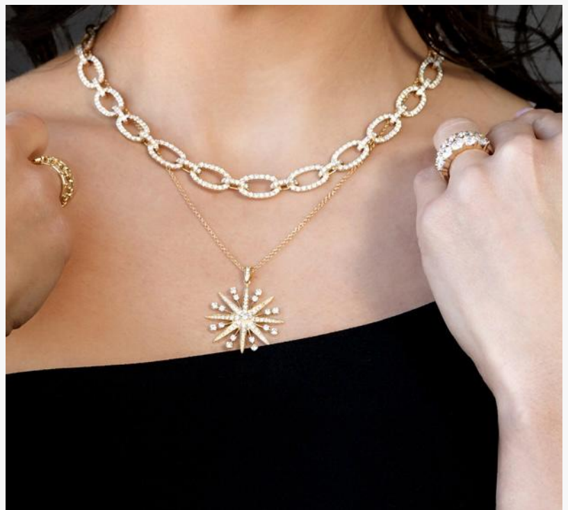
London Gold's Yael Designs Collection Necklaces