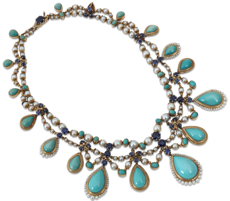
French sapphire, turquoise, cultured pearl and 18K gold necklace (est. $5,000-$7,000).

Fine jewelry from the Edmund W. and Carol Browning Dumke Family Trust includes a Cartier diamond and 18K white gold Tank bracelet wristwatch (est. $6,000-$8,000), a gorgeous French sapphire, turquoise, cultured pearl and 18K gold necklace (est. $5,000-$7,000), and a Robert Procop sapphire, aquamarine and 18K white gold ring (est. $3,000-$5,000). Louis Vuitton luggage and Judith Leiber couture evening bags will also be on offer.