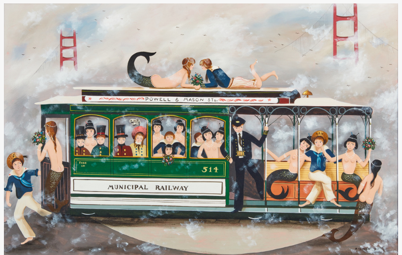
Oil on board painting by Ralph Eugene Cahoon, Jr., titled Municipal railway (Foggy Day in Frisco), 22 inches by 34 inches (est. $15,000-$25,000).