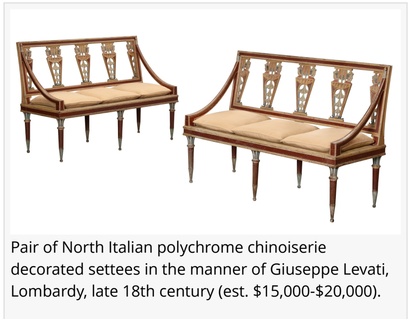
Pair of North Italian polychrome chinoiserie decorated settees in the manner of Giuseppe Levati, Lombardy, late 18th century (est. $15,000-$20,000).