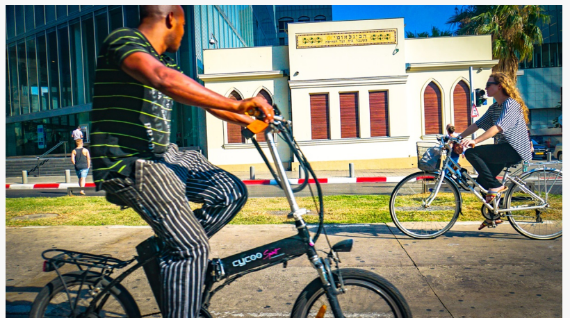
E-bike use is rising in cities around the world.

WASHINGTON DC, UNITED STATES, March 13, 2024 /EINPresswire.com/ -- New research from the Institute for Transportation and Development Policy (ITDP) and supported by the Climateworks Foundation provides the first global analysis of how e-bikes are being used and what a large-scale increase in use could mean for climate emissions. The paper strongly supports the use of e-bikes as substitutes for high-polluting, high-speed cars and two-wheelers, especially as e-bikes become more accessible and safe with clearer standards for production and use.