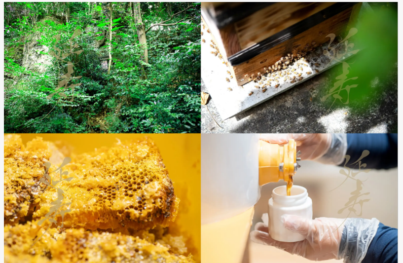
Collecting "Enju" Honey