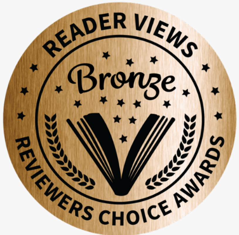
Classics Memoir Bronze Award