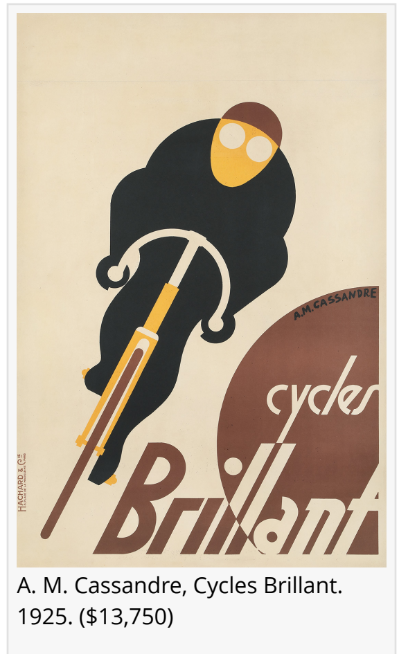
A. M. Cassandre, Cycles Brillant . 1925. ($13,750)

Art Nouveau works from Théophile-Alexandre Steinlen also performed well at auction. His spectacular six-sheet billboard, Affiches Charles Verneau. "La Rue," from 1896, was secured for $62,500 (est. $60,000-$80,000)—the top sale of this auction. His 1899 Motocycles Comiot was sold for $37,500 (est. $20,000-$25,000), and the iconic 1896 Chat Noir / Prochainement was won for $25,000 (est. $17,000-$20,000).