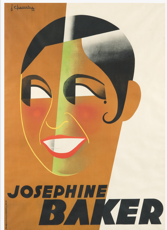
Jean Chassaing, Josephine Baker. 1931. ($23,750)