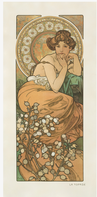
Alphonse Mucha, Precious Stones / La Topaze. 1902. ($37,500)