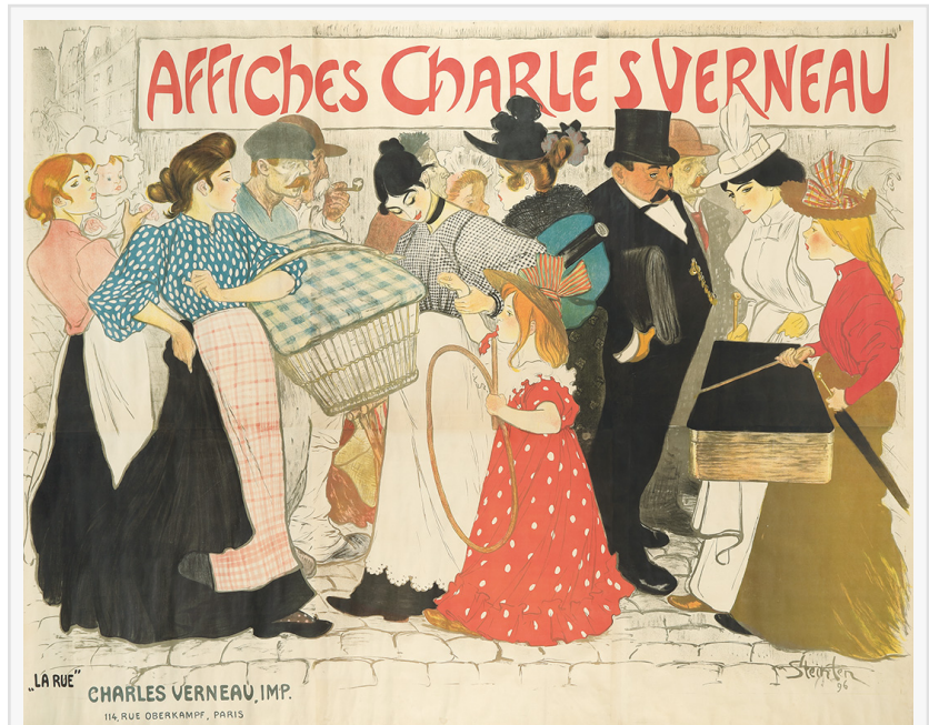
Théophile-Alexandre Steinlen, Affiches Charles Verneau. "La Rue." 1896. ($62,500)

All prices quoted include the buyer's premium.