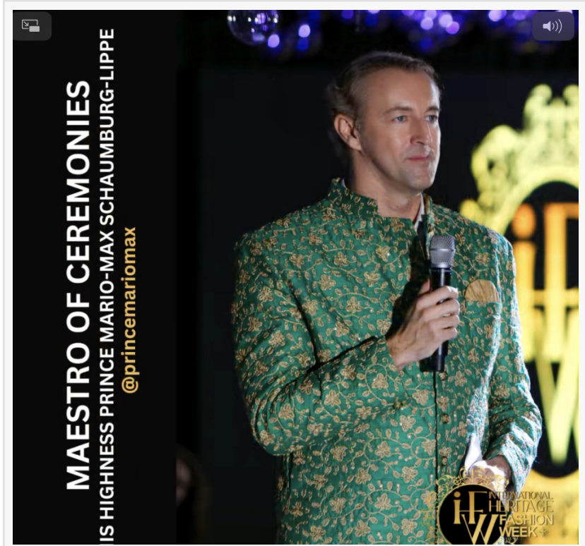
Prince Mario-Max Schaumburg-Lippe Times Square