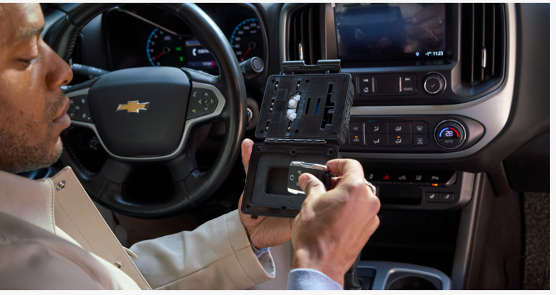
Inserting car key in the moki