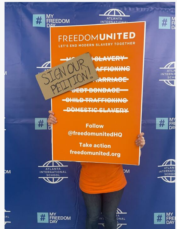
Freedom United is calling the participants of #MyFreedomDay to action to stand up against modern slavery