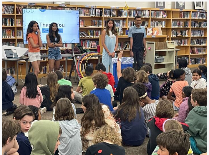
Students debunking the myths of human trafficking at Atlanta International School on My Freedom Day