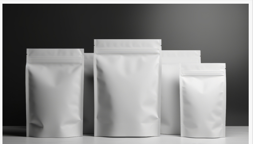
DUN-SOFT Soft Touch Film on Packaging Pouches

BRISTOL, PA, UNITED STATES, March 15, 2024 /EINPresswire.com/ -- Dunmore announces its new DUN-SOFT™ soft touch film for packaging, labeling, and plastic or metal finishing applications. DUN-SOFT™ has excellent tactile and mechanical properties including superior rub resistance, excellent printability, and it meets regulatory requirements for indirect food contact.