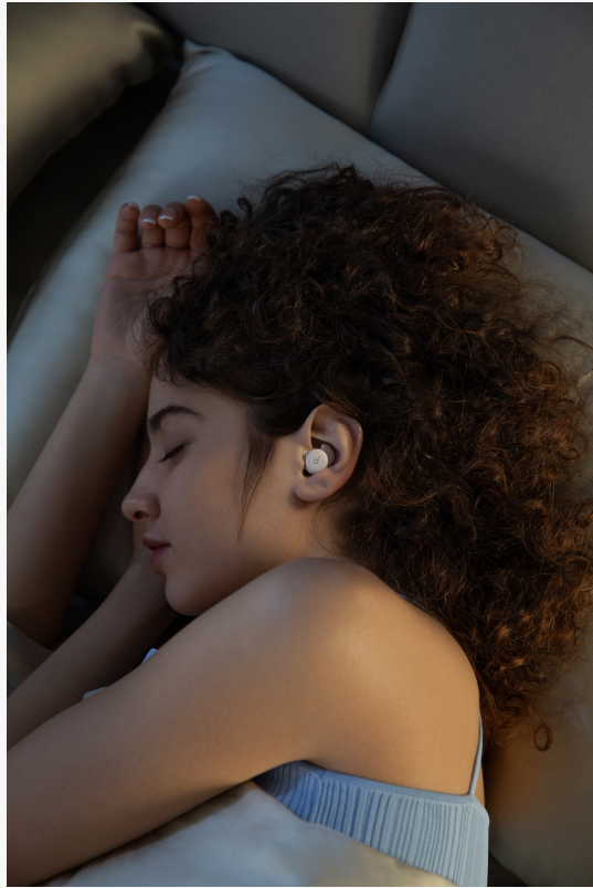
Soundcore Sleep A2 Sleeping Earbuds Are Ideal For Side Sleepers

Starting on April 16, the Soundcore Sleep A20 will be available for pre-purchase via Kickstarter in the US, UK, DE, AZ and NZ with discounts up to 40% off for the first backers. However, starting today, interested parties can also visit Soundcore.com for additional early bird specials and perks. The Sleep A20 are currently slated to be available for purchase on Amazon.com and Soundcore for $149.99 in the US, £119.99 in the UK and €149.99 in Germany in mid-late May.