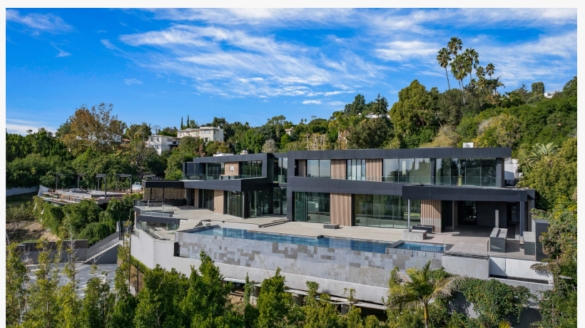
Contemporary trophy estate with city views | Photo has been rendered

NEW YORK, NEW YORK, USA, March 15, 2024 /EINPresswire.com/ -- 10710 Chalon Road , a nearly finished trophy property epitomizing refined living, will auction next month via Concierge Auctions in partnership with Aaron Kirman, CEO of AKG | Christie's International Real Estate. Bidding will open on 3 April and culminate on 15 April via the firm's online marketplace.