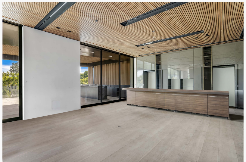
Multi-level indoor-outdoor entertaining | Photo has been rendered

From the large movie theater to the regulation-size tennis court, 10710 Chalon Road is equipped with cutting-edge amenities that cater to the desires of those seeking the highest standard of modern comfort and style. The sleek chefs' kitchens feature top-of-the-line appliances and custom cabinetry, perfect for culinary enthusiasts and entertainers alike. However, the details truly set the home apart with wood, marble, and glass finishes imbuing texture and serenity speaking volumes about uncompromising quality.