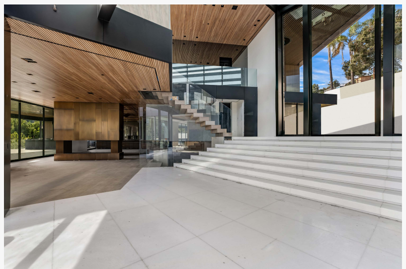
Private 1-acre property cantilevers over the hills | Photo has been rendered

The estate's construction and placement on the property aspire to the utmost privacy, tranquility, and luxury with its gated perimeter and retaining walls leaving no detail left ignored in the pursuit of elegance. A soaring glass-topped entry point welcomes visitors upon arrival. Once inside, the interior spaces convey an air of grandeur, with a lavish, open floor plan that seamlessly integrates indoor and outdoor dimensions, making the property perfect for entertaining. Buyers can visualize hosting glamorous soirées on the multi-level outdoor terrace, overlooking the Bel-Air Country Club, with a backdrop of city views that promise an oasis of tranquility amid the bustling cityscape.