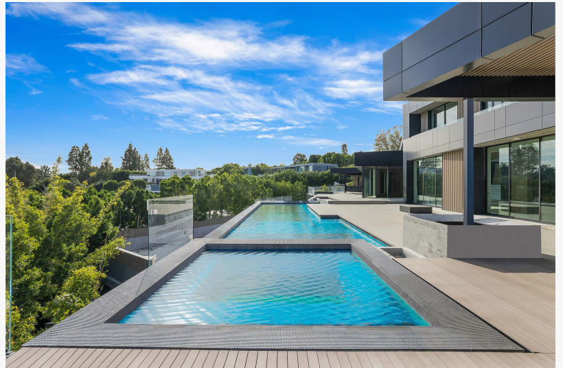
Exclusive Bel Air, overlooking golf course | Photo has been rendered