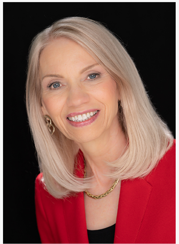
Author Judie Dziezak

This press release can be viewed online at: https://www.einpresswire.com/article/696456980