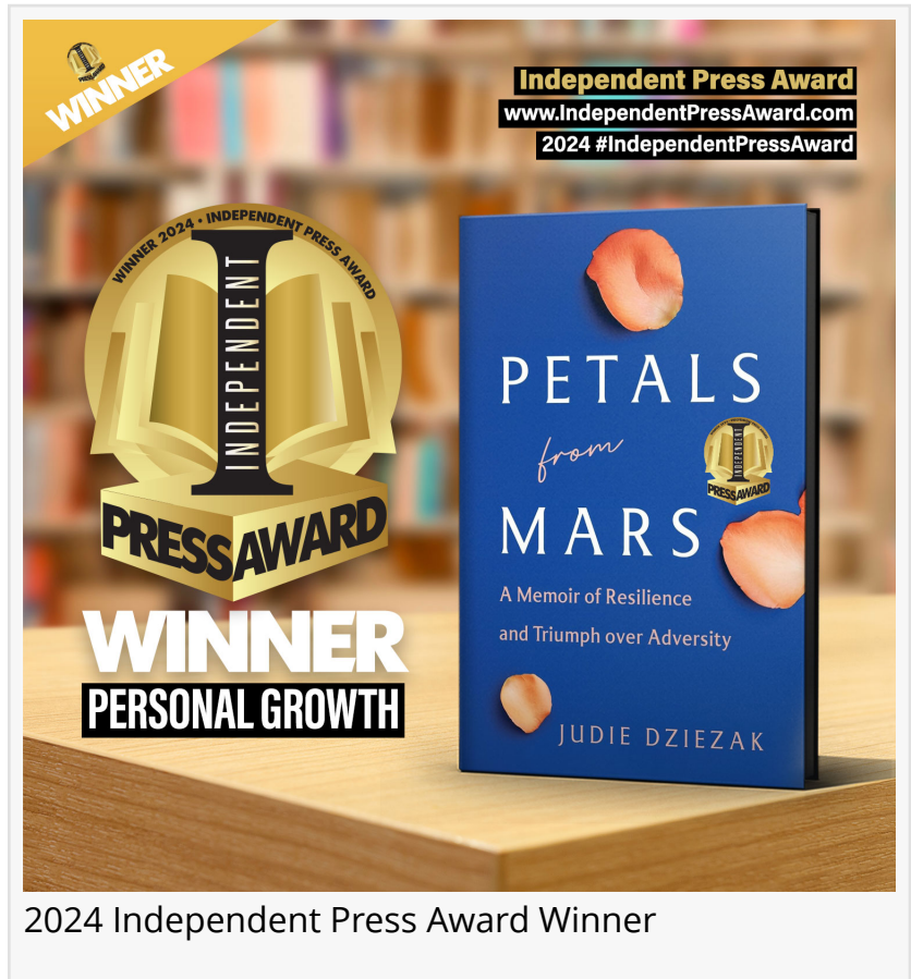
2024 Independent Press Award Winner