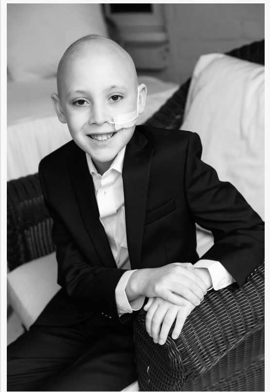
Rally Kids celebrated with Portraits of Hope and Rally Foundation for Childhood Cancer Research.

This press release can be viewed online at: https://www.einpresswire.com/article/696518536