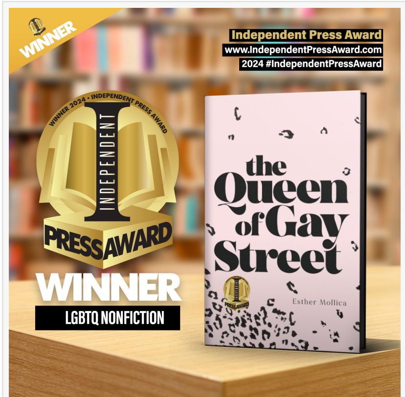
The 2024 Independent Press Award Winner in the LGBTQ category