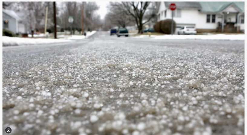
Gorilla Hail Midwest Storms

Legacy Claims Services Nationwide Coverage