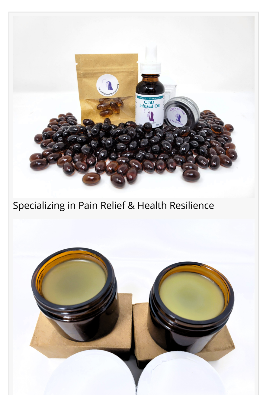
CBD multi-purpose topical salve - best seller since 2015

"We know that people use the tea for a wide variety of purposes. The hemp flower makes a great poultice for insect bites or other skin wounds; it can be smoked in place of tobacco and is less harmful and not at all addictive; it can be cooked with, made into a tincture or pure plant oil or a liniment. It's the most unprocessed and natural way of receiving the plant, besides growing it yourself," she added.