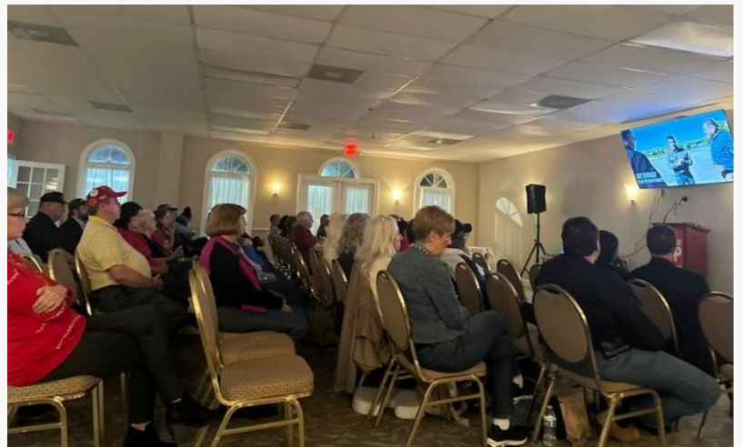
Border Invasion An American Crisis Film Premeire Fayette Georgia