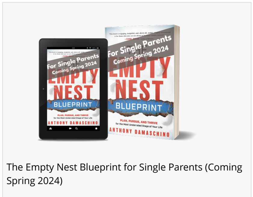
The Empty Nest Blueprint for Single Parents (Coming Spring 2024)