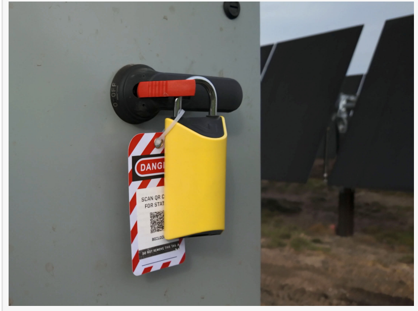
BoxLock LOTO on Solar Combiner Box

unnecessary human error, increasing accountability while setting a new standard for efficient and affordable employee protection solutions."