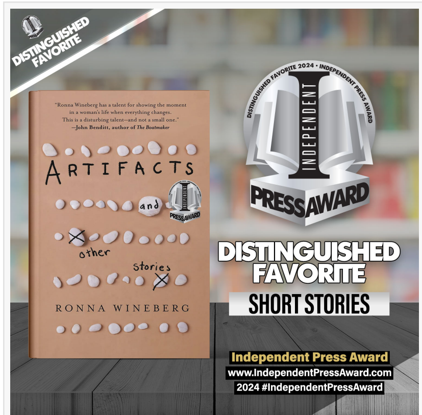
2024 Independent Press Award Distinguished Favorite