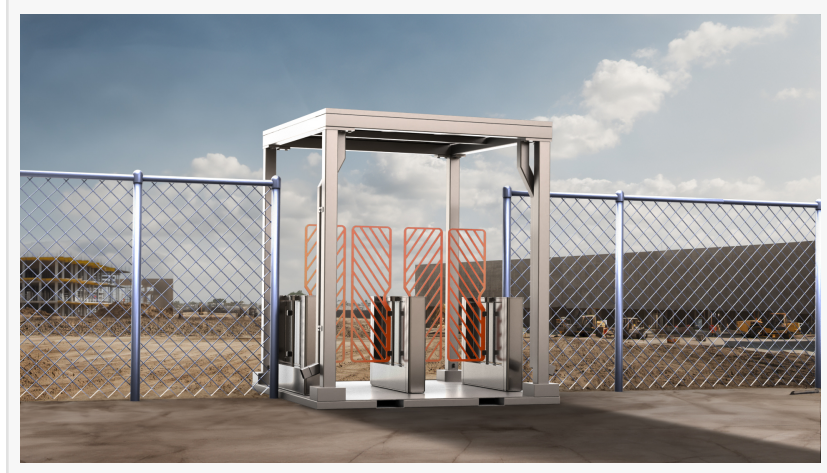
Rizon Pegasus Max Turnstile

compliance requirements including NYC's Local Law 196, which mandates that construction workers are required to carry Site Safety Training (SST) cards to verify their compliance with training requirements.