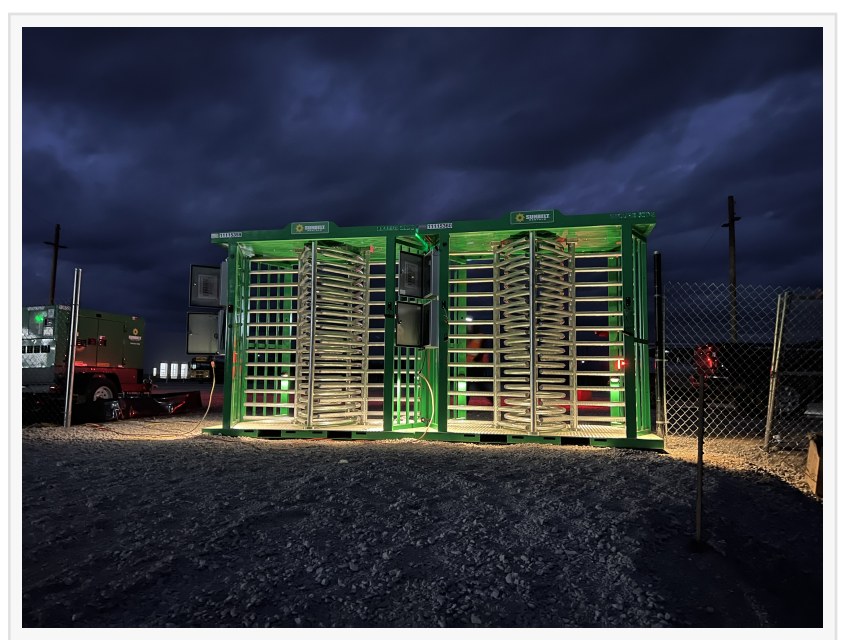
Rizon Pegasus 200 Construction Turnstile

The construction industry faces unique challenges that demand specialized solutions. The Rizon Pegasus 200 is designed to meet these needs by offering enhanced security and access control, ensuring only authorized personnel can access the site. Powered by Alvarado technology, the most trusted name in full height turnstile technology, it automates the tracking of worker presence, streamlining payroll processes and increasing operational efficiency. Most importantly, it meets safety and