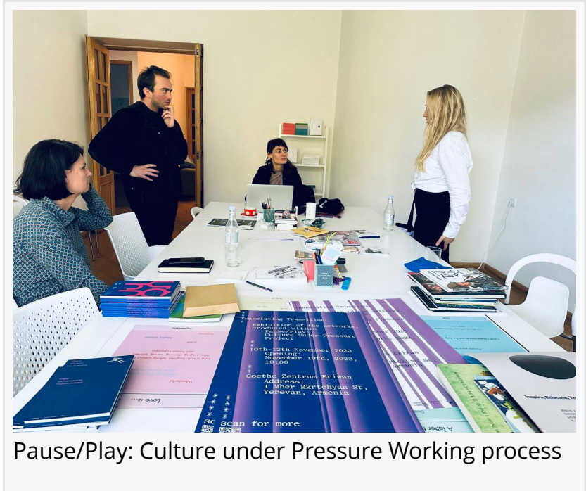
Pause/Play: Culture under Pressure Working process

* Pause/Play: Culture under Pressure is curated and organized by Kulturschafft e. V. and CSN Lab, Yerevan, in partnership with Untitled Tbilisi, with financial support from the German Ministry of Foreign Affairs.