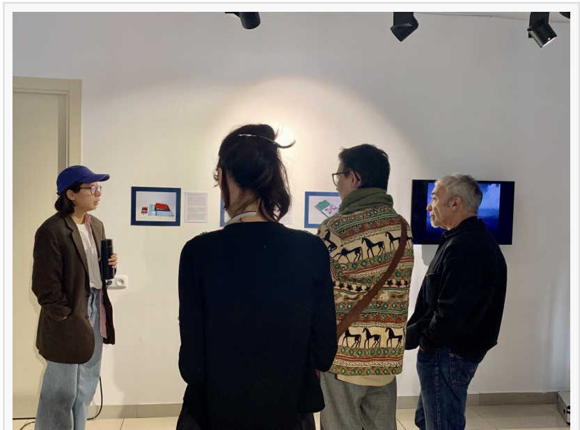
Pause/Play: Culture under Pressure

The subsequent exhibition "Translating Transition" at Goethe Center in Yerevan became an important part of the program.