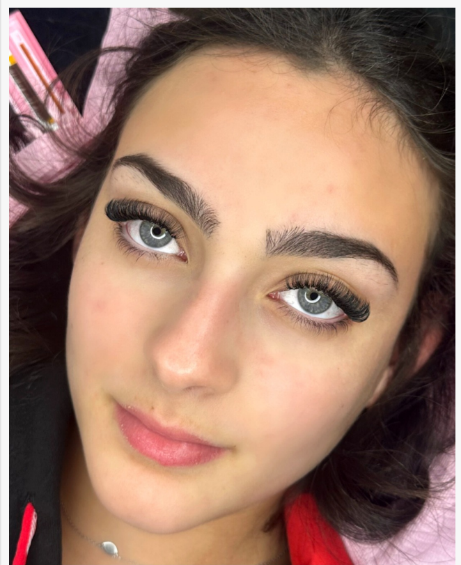
Russian volume lashes Melbourne

Understanding that beauty is also about knowledge and empowerment, Velvet Lashes and Beauty is committed to educating clients on maintaining and enhancing their treatments at home. This educational approach extends to professional lash training for aspiring beauticians, reinforcing the salon's role as a pillar of knowledge and expertise in the beauty community.