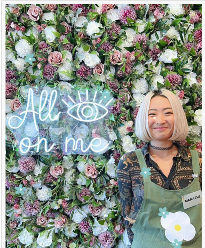
hybrid eyelash extensions Melbourne

Velvet Lashes and Beauty prides itself on its ability to offer personalized beauty solutions. With services ranging from hybrid lashes Melbourne patrons adore, to innovative lash lifts that