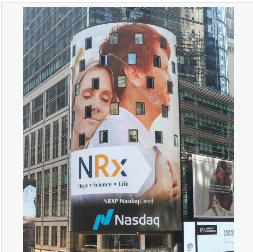
$NRXP on the NASDAQ

NRx Pharmaceuticals, Inc. (Nasdaq: NRXP) today announced that its Board of Directors (Board) has authorized its Chairman and management to take all necessary steps to affect a Dividend of HOPE Therapeutics ("HOPE") stock along with a royalty right of 1% of Ketamine sales to NRXP Shareholders and applicable warrant holders. The intent of the Board is to distribute 49% of HOPE stock in this dividend. Shares of HOPE are planned to be publicly listed.