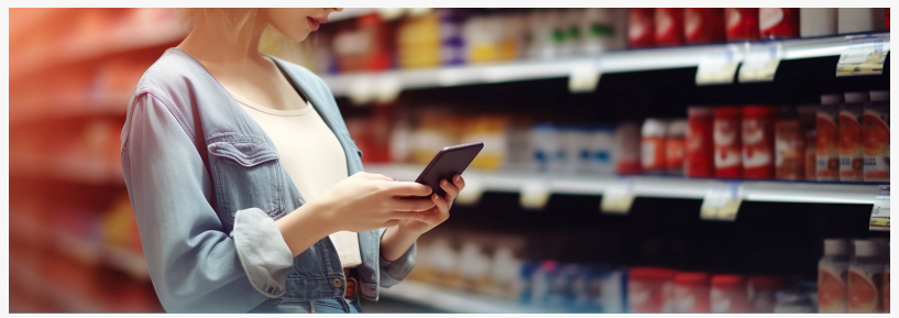
Verity One Person Scanning