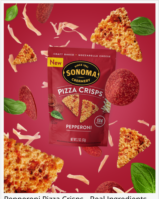
Pepperoni Pizza Crisps - Real Ingredients

Pepperoni Pizza Crisp<sup>™</sup> encapsulates the essence of pizza in a convenient, bite-sized format, delivering everything you love about pizza in a