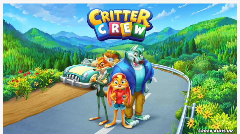
Critter Crew KV

Critter Crew is a match-3 puzzle game that features loads of unique gimmicks, a collectable coloring game, play-enhancing sound design, and appealing modern UI/UX. These accompany familiar genre staples such as rankings, events, and team functions that allow players to chat worldwide. Taken as a whole, Critter Crew delivers match-3 players a fresh experience. The development team's "snappy and stress-free" design philosophy is evident throughout, even on the technical level. The app has a surprisingly small download size and loads quickly. As no internet connection is required, players can enjoy the game anytime and anywhere.