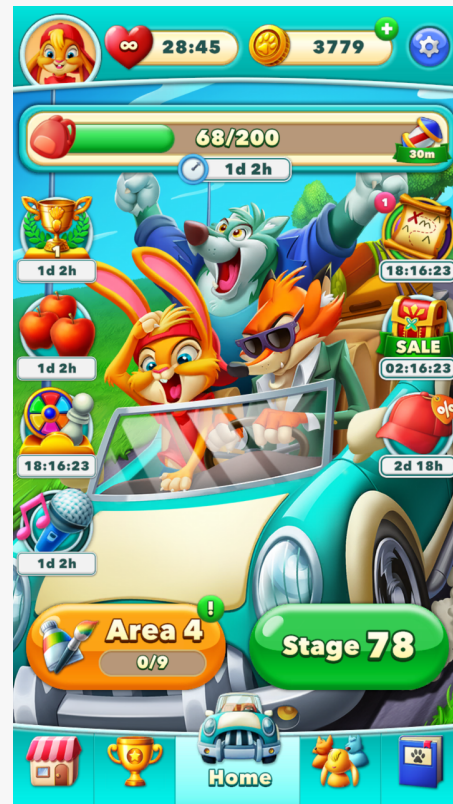
Critter Crew Home screen