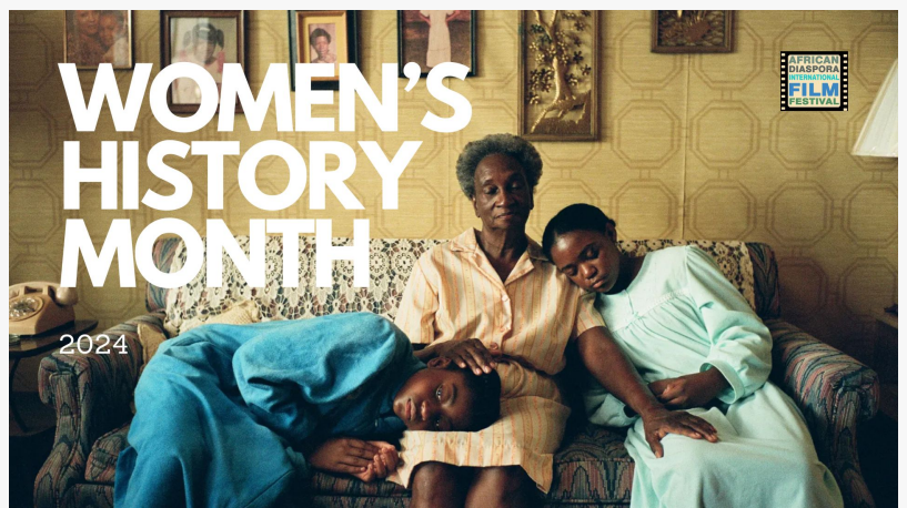
ADIFF Women's History Month

NEW YORK, NEW YORK, UNITED STATES , March 19, 2024 /EINPresswire.com/ -- To celebrate Women History Month , the African Diaspora International Film Festival (ADIFF) – in collaboration with the Office of the Vice President for Diversity and Community Affairs, Teachers College, Columbia University -