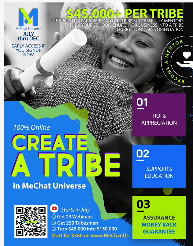
MeChat Universe Create a Community Flyer