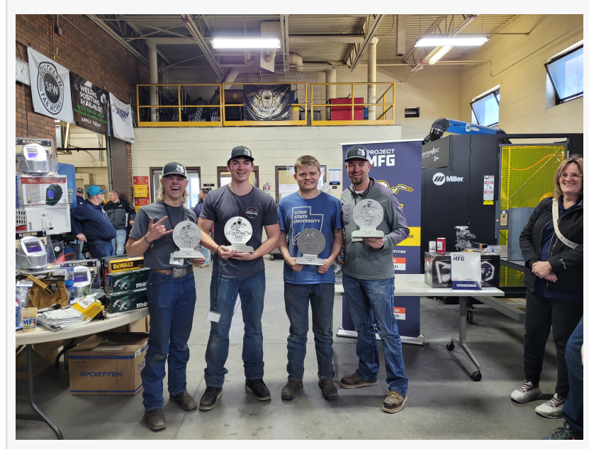
Welding Wars 1st Place Team Fabrication - Team from Green Canyon