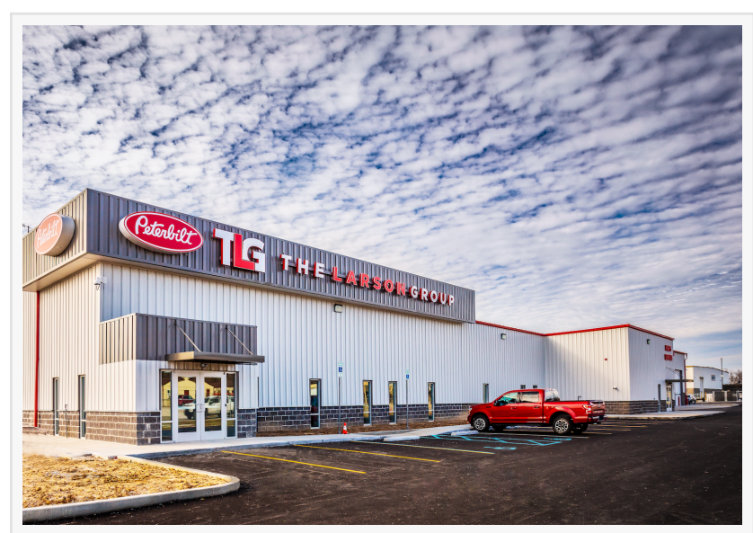
TLG Peterbilt - Evansville now offers 35,000 square feet of first class amenities and increased truck service capacity.

EVANSVILLE, IN, UNITED STATES, March 20, 2024 /EINPresswire.com/ -- The Larson Group (TLG), a <u>Peterbilt</u> dealership with 25 locations in eight states, has completed construction on substantial updates and additions to its TLG Peterbilt – Evansville location. Over 23,400 square feet of office, warehouse and service building space has been added to the existing building as a response to the immense growth of the dealership since it first opened in 2010.