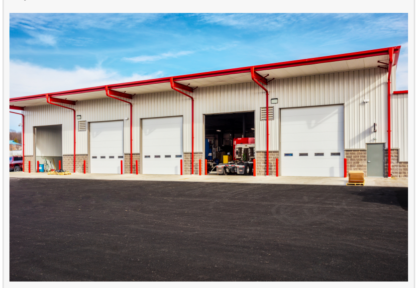
The Evansville dealership can now service more trucks with 15 total service bays including a wash bay.