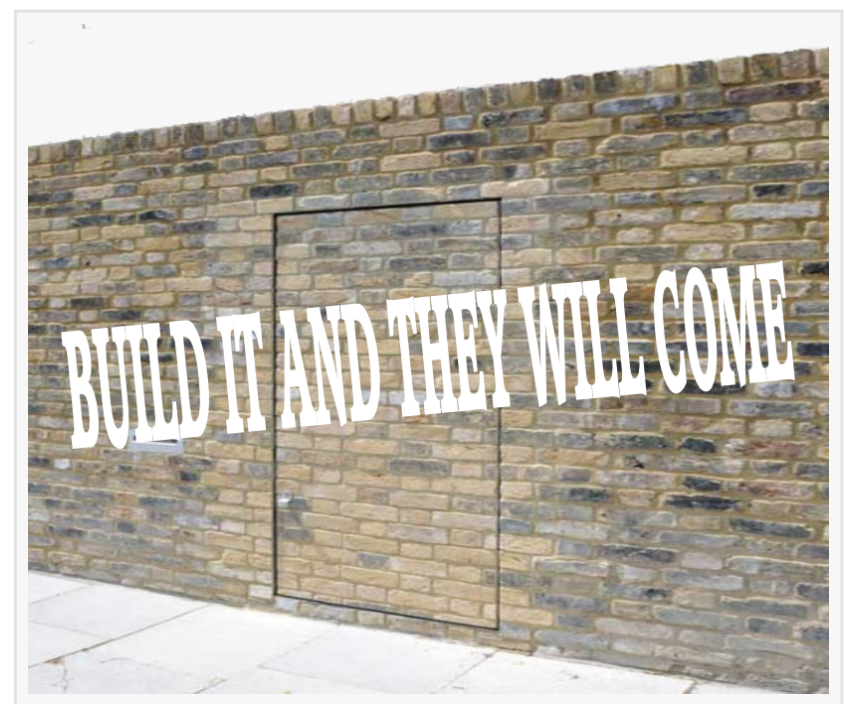
We built it. The image below explains what it looks like, what you can do with it, what is does and why ...