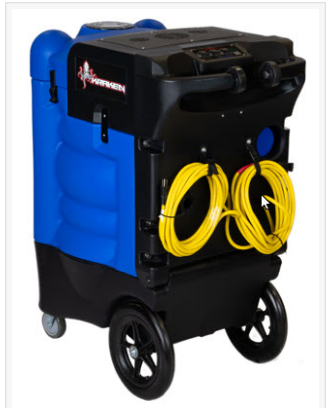
The new U.S. Products Kraken Professional-Grade Flood Extractor relies simply on 15-amp power sources. When minutes matter, the Kraken gets the water out fast and the area cleaned up.