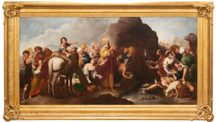
Monumental 19th century Old Master style oil on canvas Old Testament Biblical figural scene after Bartolome Esteban Murillo (Spanish, 1617-1682), titled Moses at the Rock of Horeb (est. $8,000-$12,000).