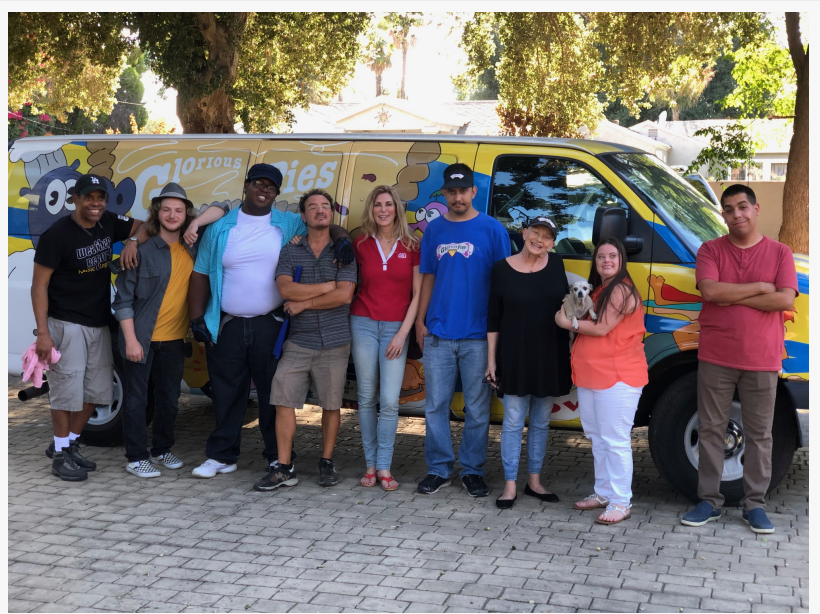
"A Special Recipe for Those Who Need"

From the chocolate covered caper of her award winning film, "Cocoa", where a revolutionary chocolate cake defies the laws of calories, to "Needs to Bake" a reality tv show featuring the neuro-diverse community in America, where the creation of a bakery opens the doors to their hearts desire.